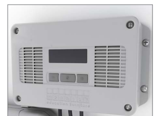
Power7 Energy Management System