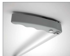
Concealed back door release