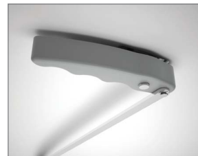
Concealed back door release