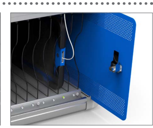
Retractable metal door