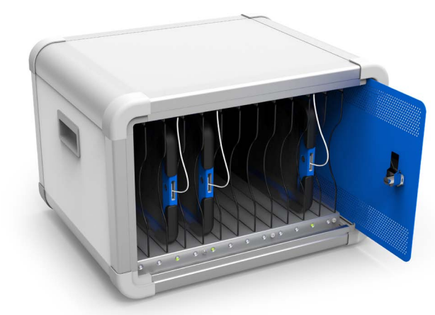
DeskCabby Front Open