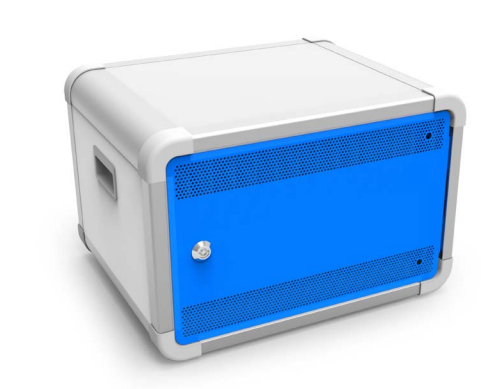
DeskCabby Front Closed